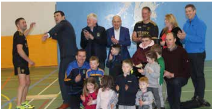
Minister of State for Sport and Tourism Brendan Griffin TD joined club members and officers from Spa GAA Club and guests from Glenbeigh Handball Club at the official launch of Spa Killarney Handball Club