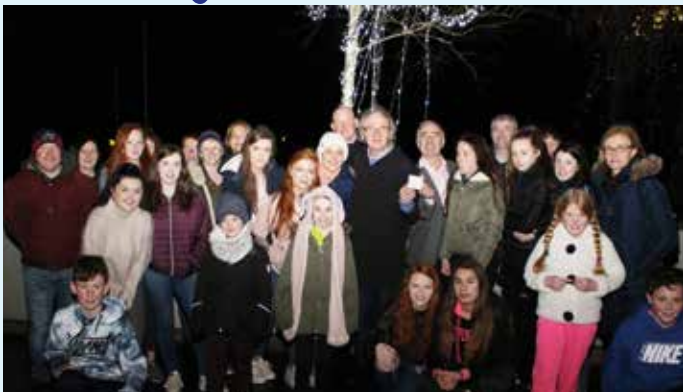
Lighting of the TREE OF REMEMBRANCE at Spa GAA Club on December 9th 2017

The Senior Lady footballers had the idea to set up a Remembrance Tree on the club grounds. The Tree was to remember all our deceased loved ones no longer with us. They didn't just want a memorial tree but wanted to remember all the loved ones that couldn't be in Killarney over the holiday season due to work, illness etc.