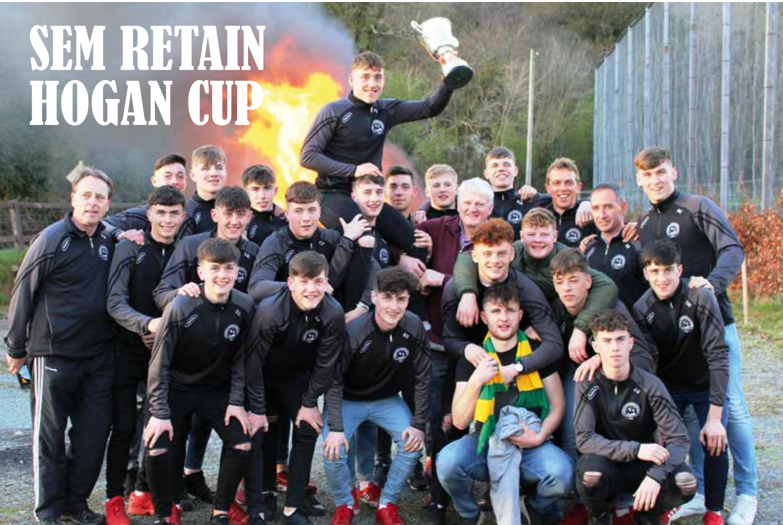
A welcome reception in Spa with the traditional bonfires for the victorious Sem team and management.