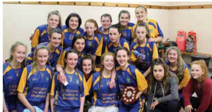
East Kerry U16 Division 3 Champions

U15 Girls played against Beaufort in the knockout championship. Very unlucky on the day going into extra time but to lose by the narrowest of margins"