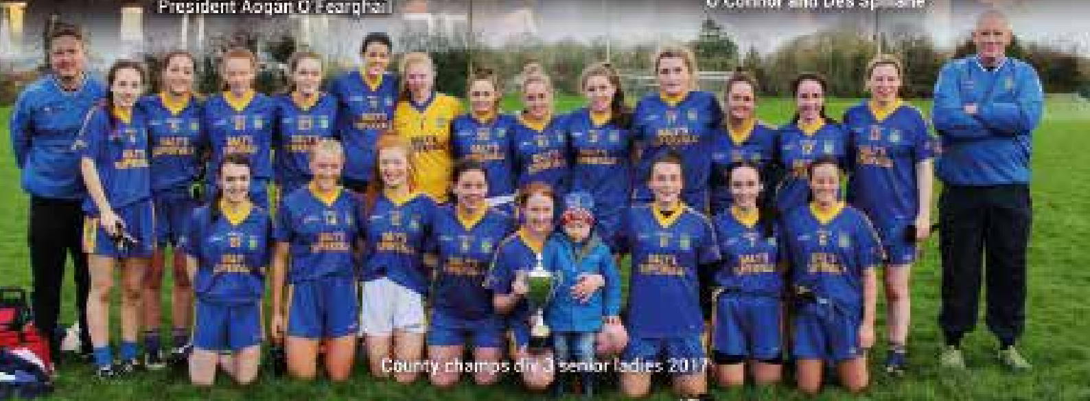
County champs div 3 senior ladies 2017