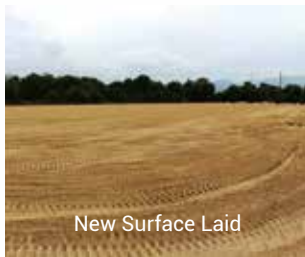
New Surface Laid