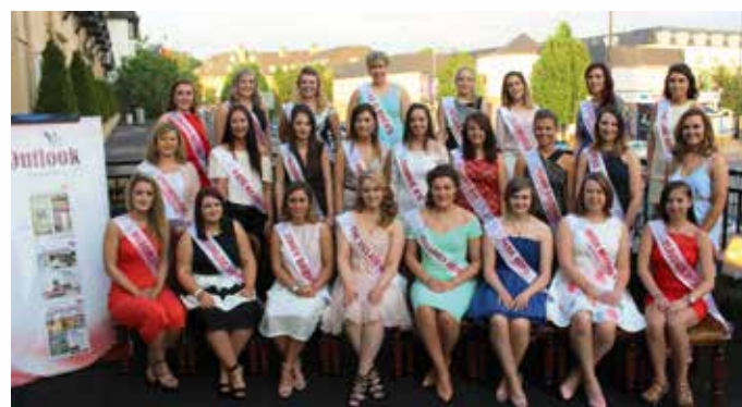
27 lilies of Killarney group 2016