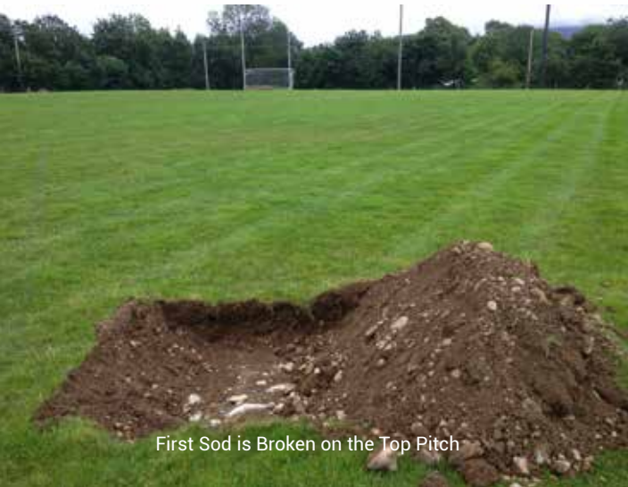
First Sod is Broken on the Top Pitch