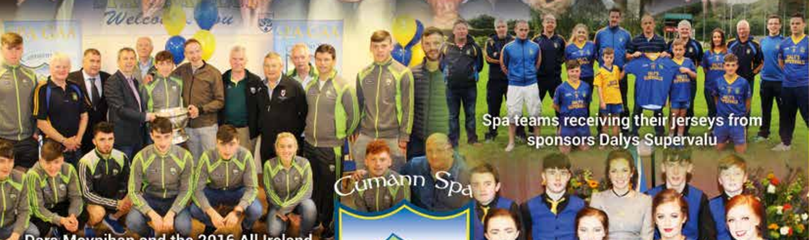
Spa teams receiving their jerseys from sponsors Dalys Supervalu