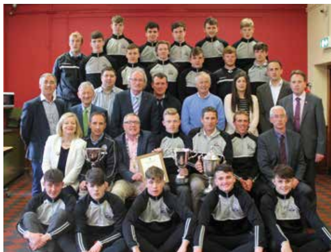
The All Ireland winning Hogan Cup champions at the Civic Reception from Kerry County Council to mark their historic victory