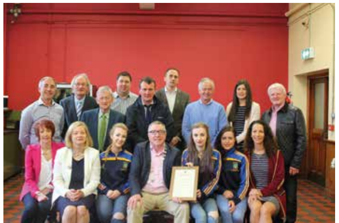
Spa Figure Dancers at a Civic Reception from Kerry County Council to mark their All Ireland Scór title