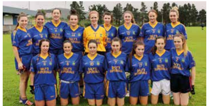
Senior Ladies 2016