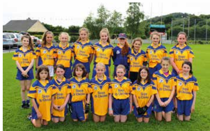
U13 Girls 2016

InBhear Sceine Gaels, Firies, Dr. Crokes, Rathmore and Glenflesk. Played five games and unfortunately won none, but we came so close. This team is very young and got stronger with every game. We didn't enter into the grouping stage as we struggled with numbers and the young players were nervous as this was their first competitive year.