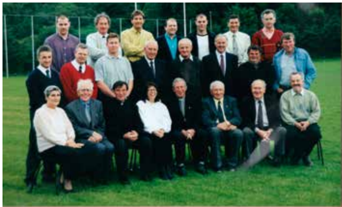
SPA HISTORY COMMITTEE WITH CLUB MEMBERS & SUPPORTERS 1998