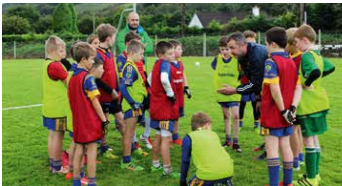
Team Talk with the U10 Boys