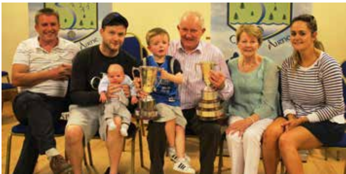
Three generations of the Cronin family