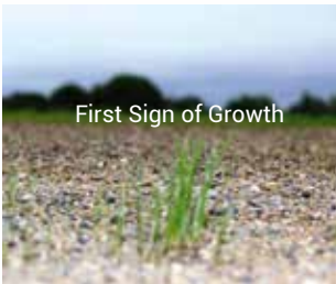
First Sign of Growth