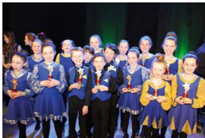
Our young Scór na bPaistí competitors