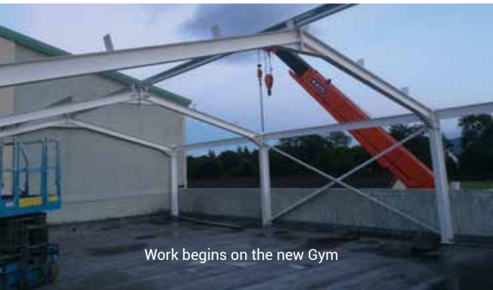
Work begins on the new Gym