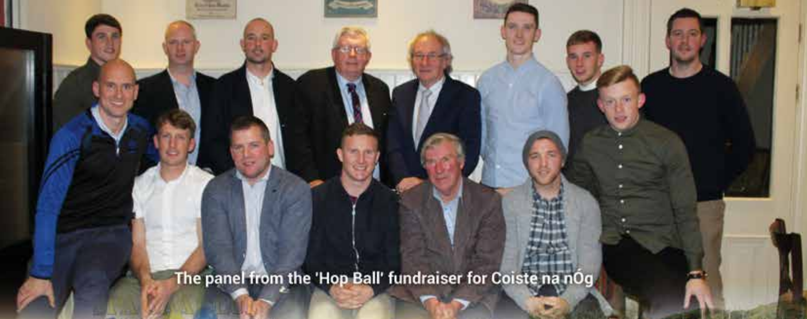
The panel from the 'Hop Ball' fundraiser for Coiste na nÓg