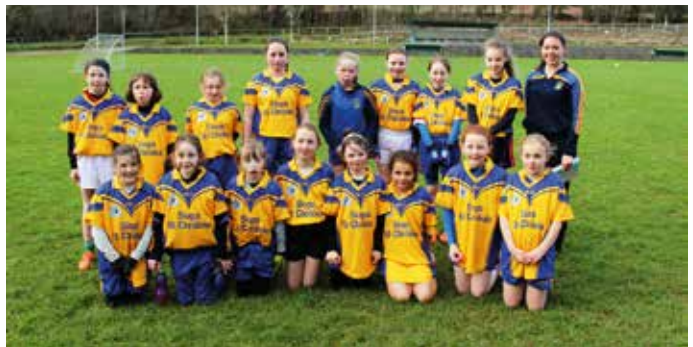
U12 Girls 2016