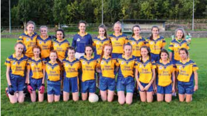
U16 Girls East Kerry Finalists 2016