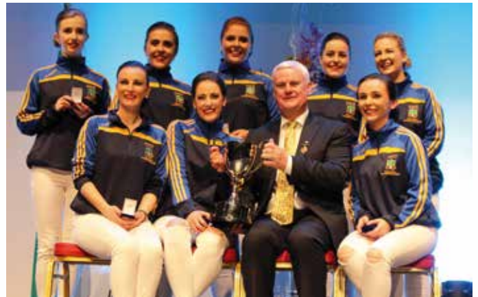
Scór Sinsear Figure Dancers