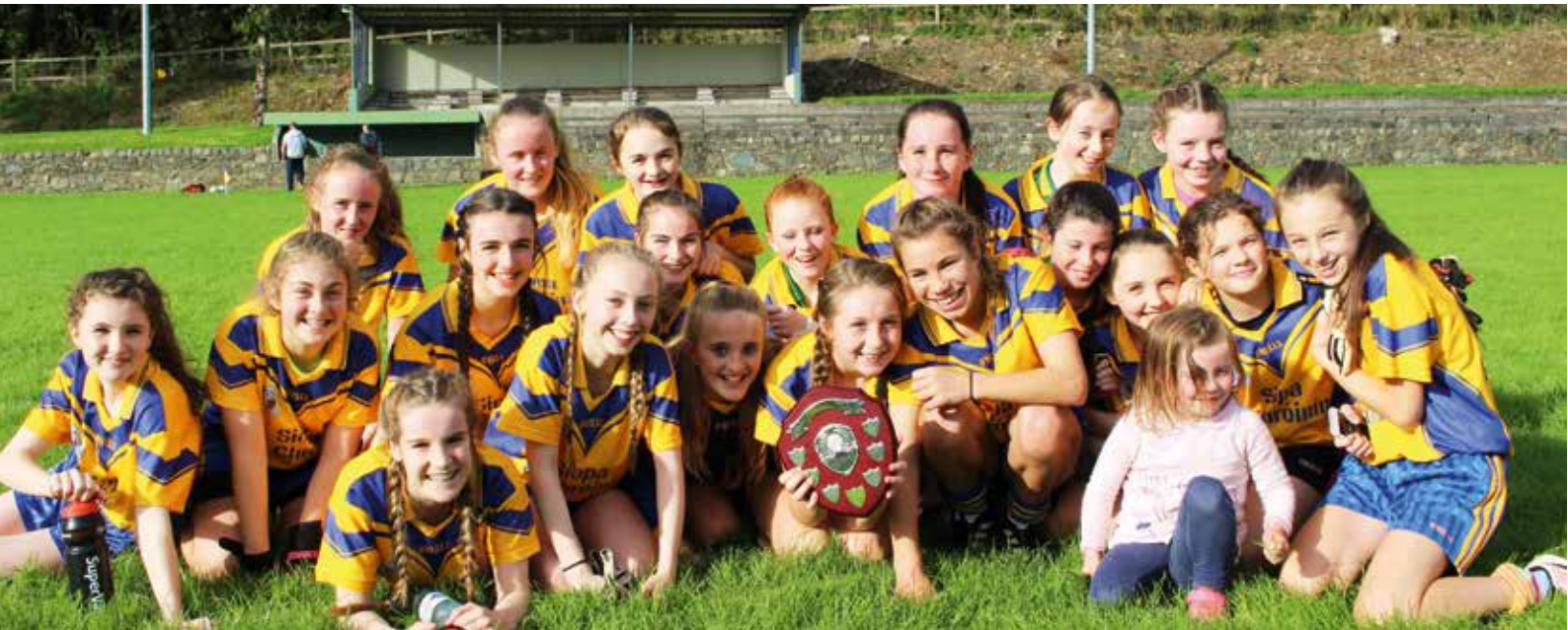
U14 Shield Final Winners