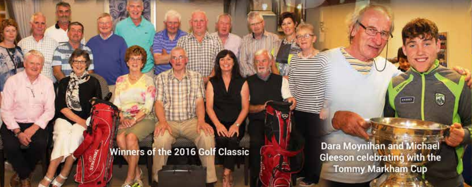
Winners of the 2016 Golf Classic