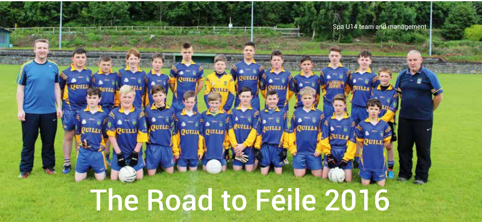
Spa U14 team and management